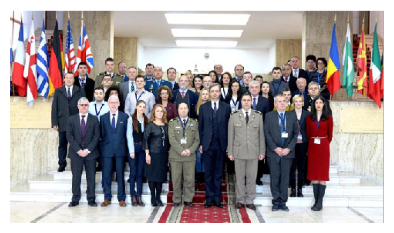
Group photo with the Conference's participants

The scientific activity was honored by the presence of many military and civilian experts in various fields: defence, public order, national security, scientific research and higher education military and civilian, in the country and abroad.