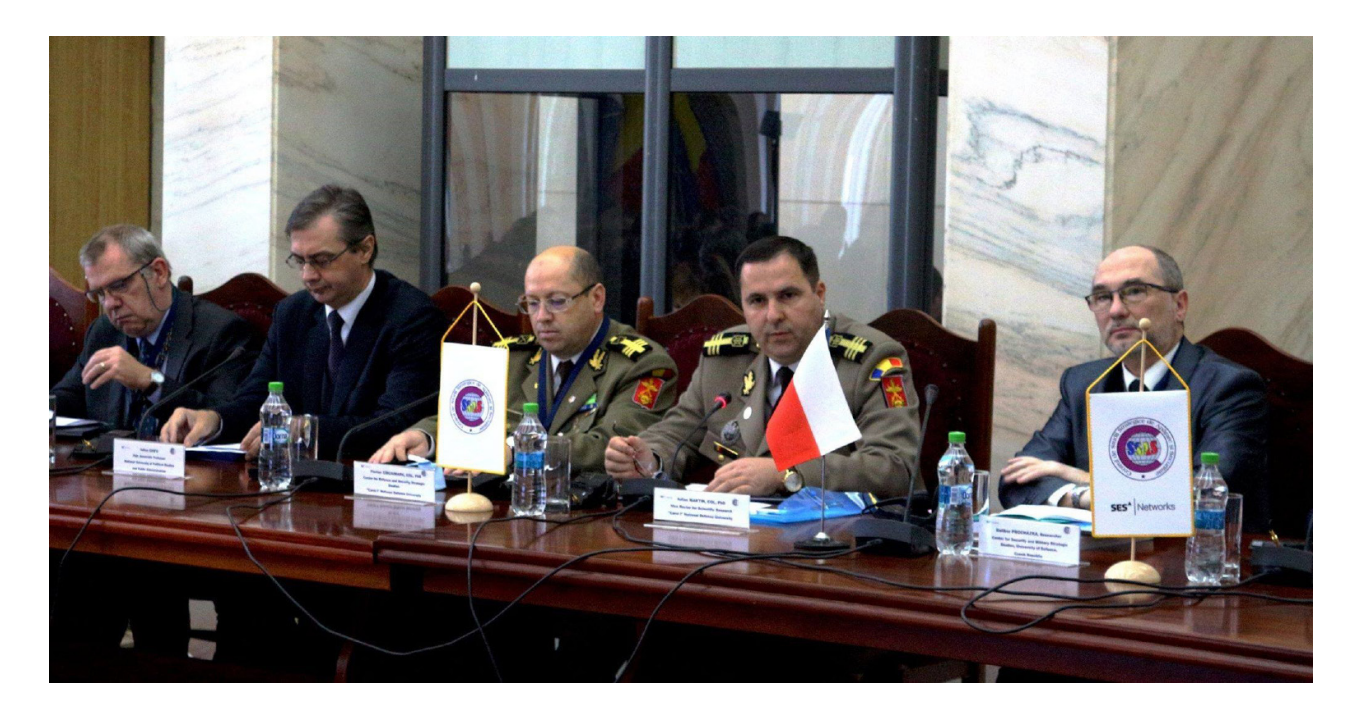
Aspect from the Conference

Within the conference framework were presented scientific papers by representatives of civil and military universities from Ministry of National Defence, Ministry of Internal Affairs, Romanian Intelligence Service, Ministry of Regional Development, Ministry of Public Finance, as well as similar institutions from other countries. The foreign presence consisted of participants from the National University of Public Services in Budapest (Hungary), the Defence and Security Strategic Studies Center within Armed Forces Military Academy "Alexandru cel Bun" in Chisinau (Republic of Moldova), the Defense University of Brno and Masaryk University in Brno, the National Defence Academy in Tbilisi (Georgia), SES Techcom SA in Luxembourg (Luxembourg), Canadian Embassy in Romania, China Embassy in Romania and the Embassy of France in Romania.