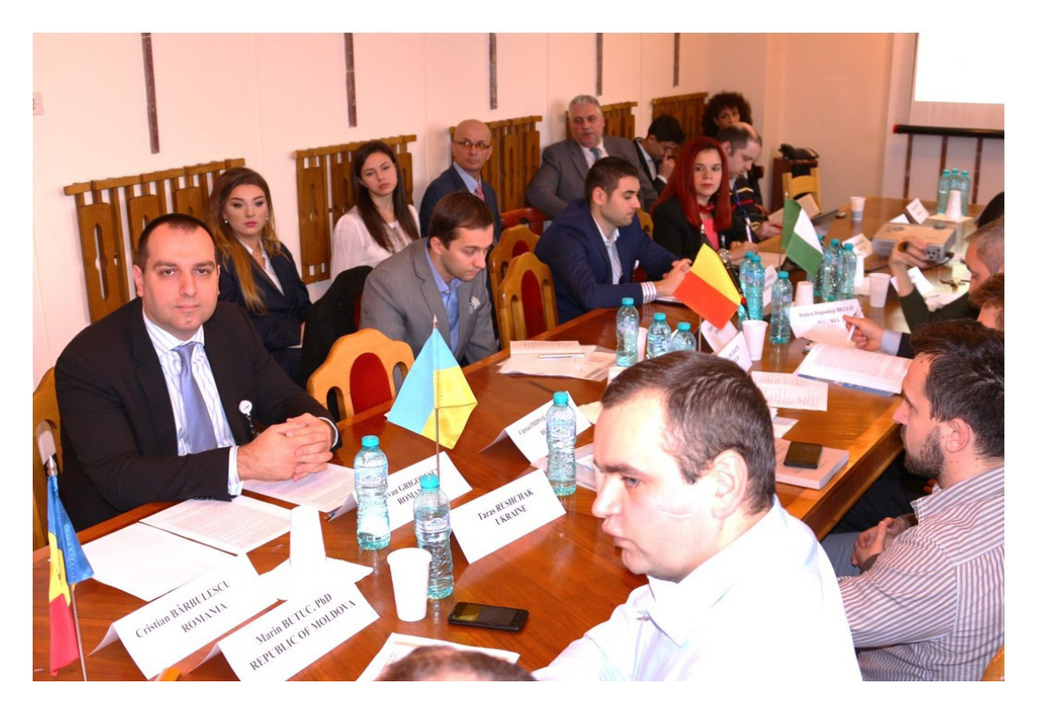
Aspect from International Scientific Conference STRATEGIES XXI

During the same period, we published a study entitled The influence of conflicts from North Africa and Middle East on European Security , conducted by PhD. Researcher Mirela Atanasiu.