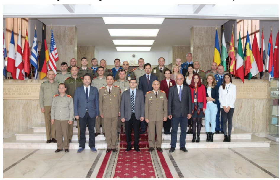
Aspects from the workshop "Cross-Border Threats and Political Risk"

On October 6, the CDSSS held a first workshop on Cross-border threats and political risk. The activity was attended by specialists from the Ministry of National Defence, Ministry of Interior Affairs, Romanian Intelligence Service and other governmental and nongovernmental institutions. The main issues addressed during the public lectures and discussions were: informational aggression – means of shaping the information environment to achieve strategic objectives; illegal immigration phenomenon and asylum – associated terrorist risks; the terrorist threat against Romania; measures to combat illegal migration by the Romanian border police and political risks in the current security context.