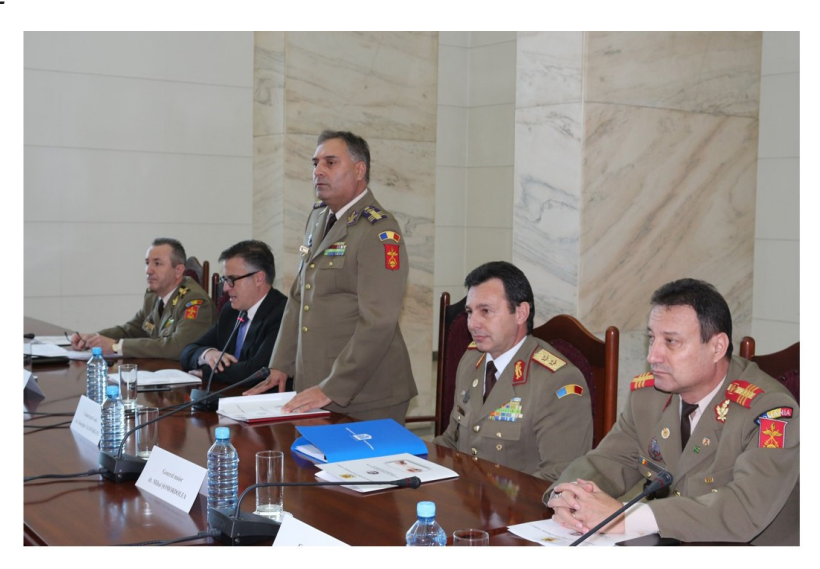
Aspect from the Scientific Symposium on the theme "Change and constancy in the Euro-Atlantic security post-Warsaw"

Referring to publications, from the beginning of the academic year, there were developed several