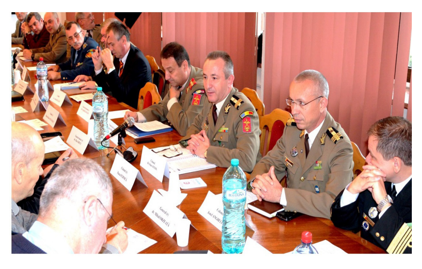
Aspects from the workshop "The Role of Territorial Defence in the National Security System"

Materializing. The event offered an opportunity to exchange ideas and experience on the issues mentioned and deepening of issues related to the subject, such as: territorial defence conceptualization; the role, missions and specific actions of territorial defence units; legislative, organisational and endowment materialisation; training of territorial defence units.